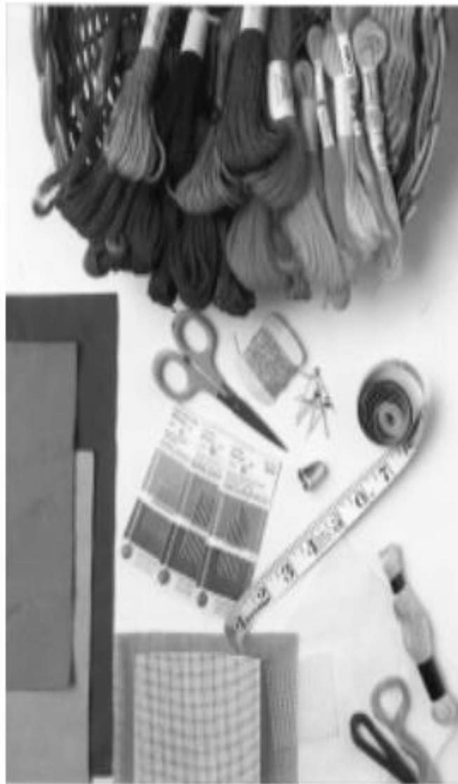
Fig. 1: Embroidery