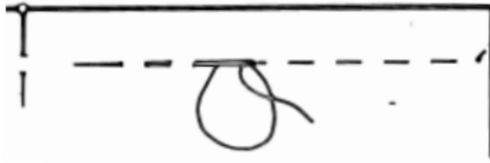
Fig. 1: Even Basting