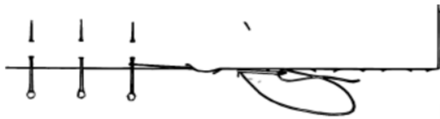
Fig. 4: Slip basting

To slip baste, work from the right side, turn under the seam allowance on one piece, and lap it over the seamline on the other piece. Using a single thread of contrasting colour take a short stitch on the seamline of the under piece. Slip the needle through the fold of the upper piece and repeat the stitches. The needle is never brought through the upper surface of the top layer. Slip basting is used to match patterned fabrics where seams have to be stitched from the right side of the fabric. (Figure 4).