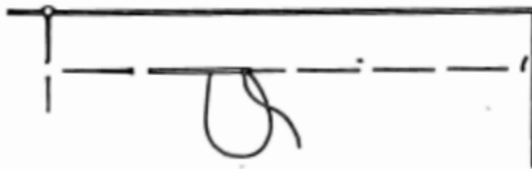
Fig. 2: Uneven basting

A single thread of contrasting colour is used. Secure the thread with a knot on the wrong side or with several small firm stitches. Make two stitches one \frac{1}{4} " long and the other \frac{3}{4} " long and repeat from one end of the cloth to the other. Secure the thread well at the end of the seam. Uneven basting is used to stitch the fall of sarees and later removed when permanent stitches have been worked. It is also used as a guideline to stitch straight lines. (Figure 2)