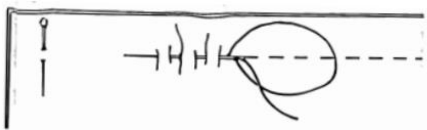
Fig. 5: Running Stitch

Running stitches are usually 1/8 inch or less in length. Work by taking several stitches on a long needle as the fabric permits. Very fine running stitches replace machine stitching on seams used in lingerie, blouses and infants clothes (Figure 5)