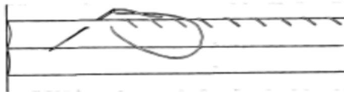
Fig. 7: Over Cast Stitch

Overcast stitches are worked to keep the raw edges from fraying and may be done on single or double edges. Hold the raw edges of the seams with the thumb and fingers of the left hand. Insert the needle from behind the raw edge and 1/8 inch below it. Space the stitches evenly and twice as far apart as they are deep. (Figure 7).