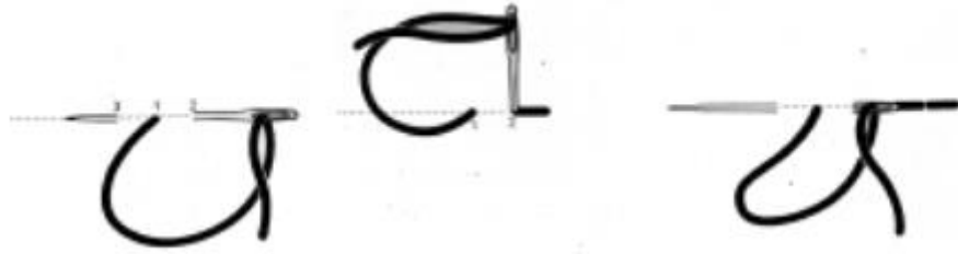
Fig. 6: Back Stitch