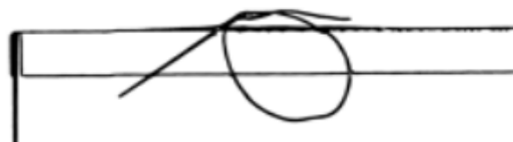
Fig. 8: Overhand Stitch

Overhand stitches are similar to overcast but are made in the very edge of the fabric and 1/16 inch apart. Insert the needle straight toward you and use a short and very fine needle in order to pick up tiny stitches. Overhand stitches are used to apply lace or to make flat invisible seams where two folded edges join. (Figure 8)