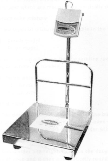
Fig: Weighing machine