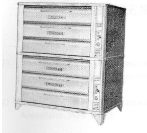
Fig: Deck oven

There are single, double and three decked oven available in the market. Types of oven, the product trays or moulds are placed on the oven floor. Bread baked directly on the floor of the ovens and not in pans is often called hearth breads. Deck oven for baking breads are equipped with steam injectors.