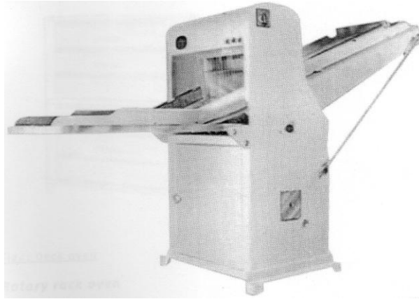
Fig: Bread slicer

Gravity feed slicer are best suited to the small, wholesale and large retail bakeries where a great number of sliced breads are produced. All types of white and sweet bread can be sliced without wastage or damage. The cut slices come out at the output end.